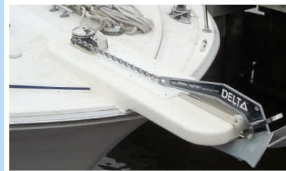
Custom Fabricated Bow Pulpit and New Windless Added