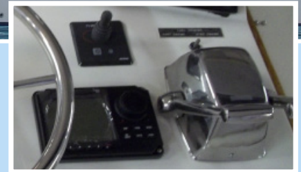
Simrad Autopilot and Vetus Bow Thruster Controls