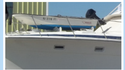
Tender in Place with Custom Fabricated and Reinforced Chocks