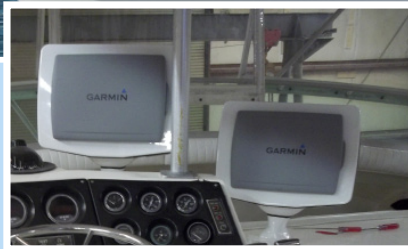
New Garmin Electronics using Pod System