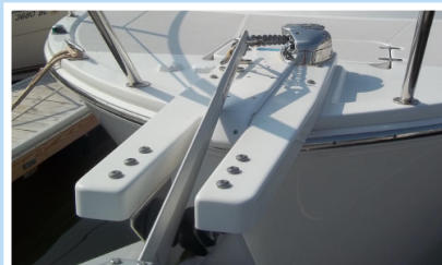
Custom Fabricated Bow Pulpit