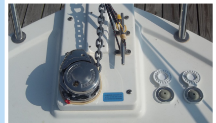
Windless with Bow Controls