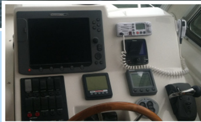
New Raymarine Electronics