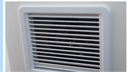
Fiberglass Fabrication for A/C