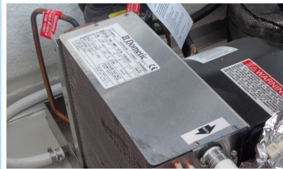
Marine Air 15k BTU A/C and Heat