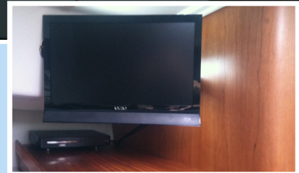
Flat Panel TV's in Salon